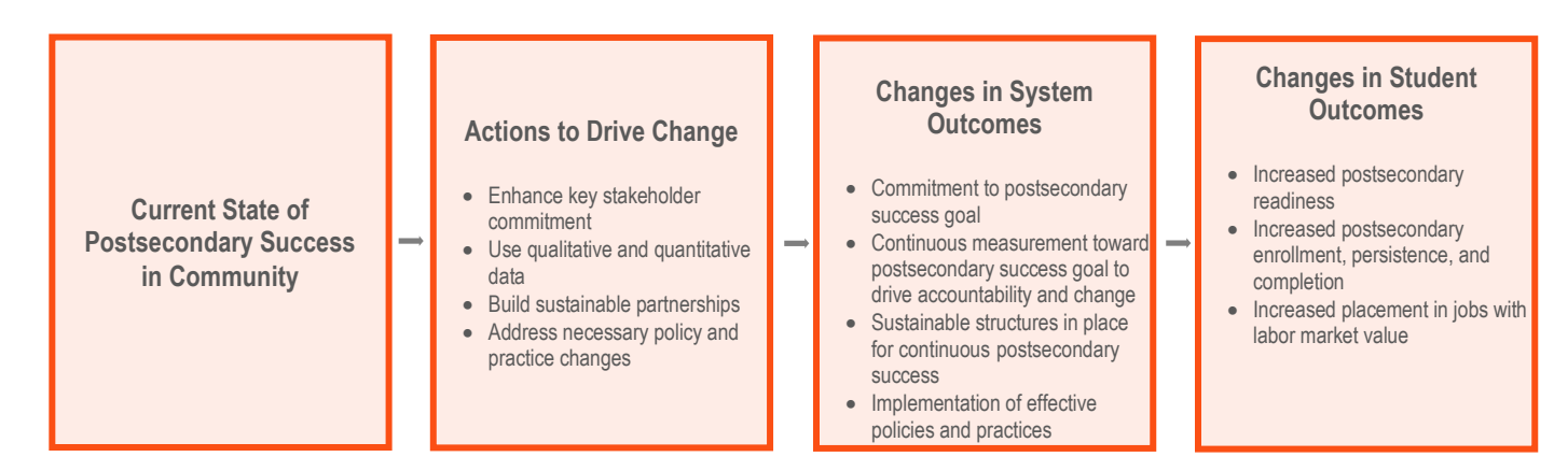
Figure 1: Community Partnerships Theory of Change

With the Theory of Change setting some broad parameters, selected sites, equipped with local knowledge and expertise, translated the Theory of Change into practice in tandem with their coaching and technical assistance providers.